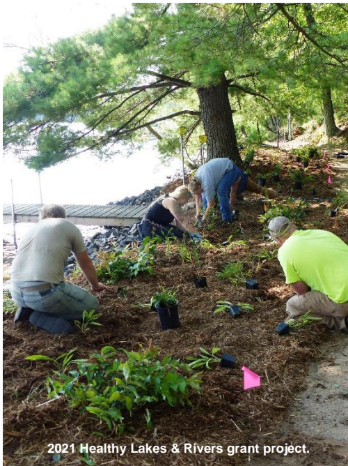
2021 Healthy Lakes & Rivers grant project.