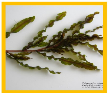
Curly-leaf pondweed ( Potamogeton crispus )

Curly-leaf pondweed has been found in Middle Eau Claire Lake; approximate points are marked on map. Please help us control this Aquatic Invasive Species by decontaminating your boat before entering and after leaving the lake.